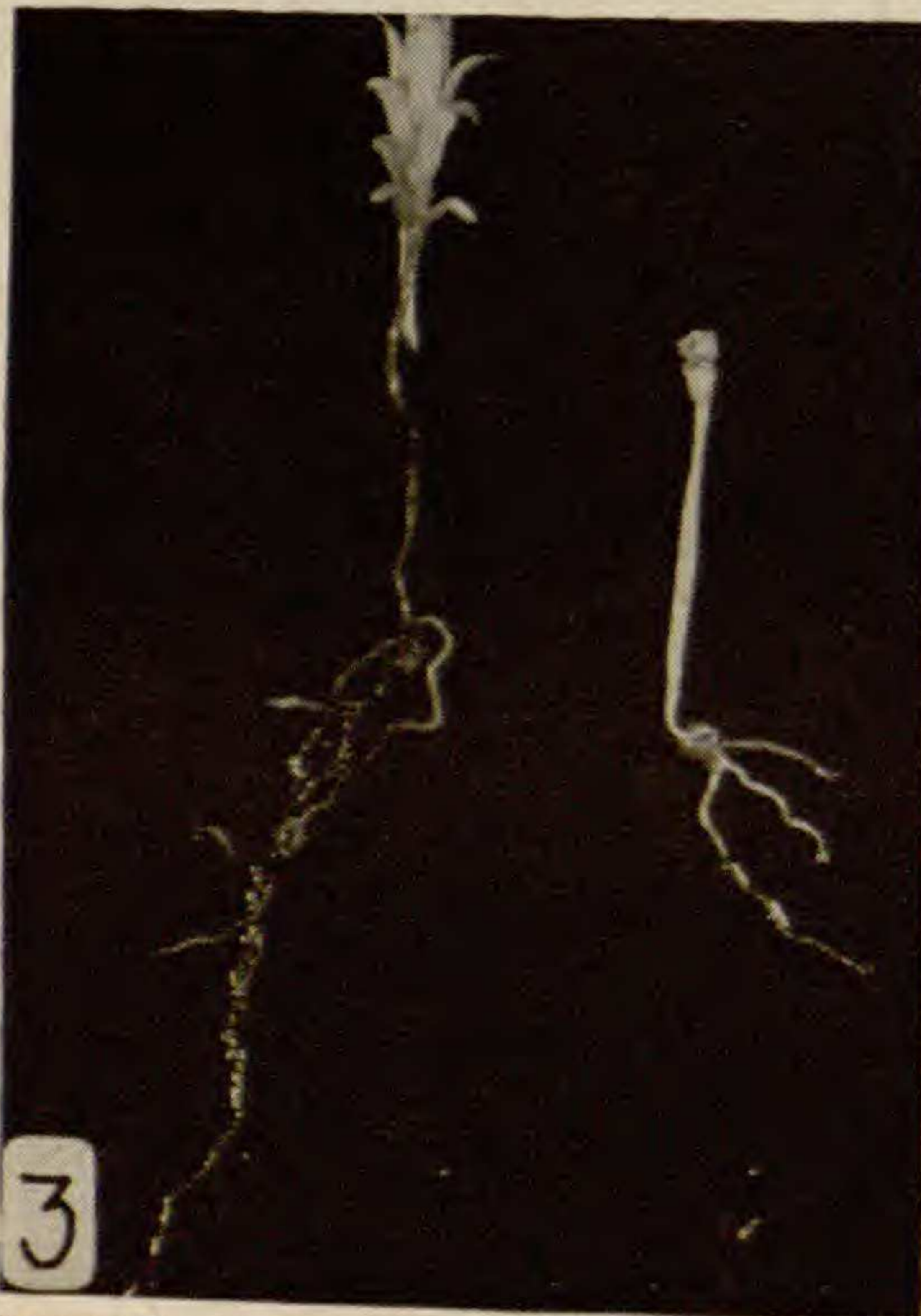
FIGURE 3. SPORELINGS OF S. DENSA . \times 4.5.

Such a mechanism has not as yet been explained for xerophytic Selaginellas, but certain information suggesting possible mechanisms should be mentioned. Leclerc du Sablon (1889) early suggested that there is a reserve substance in the cells of